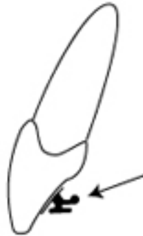
Traditional back side (Lingual) brace

Large, high profile protruding features cause great irritation to tongue, difficulty speaking and creates food trap.