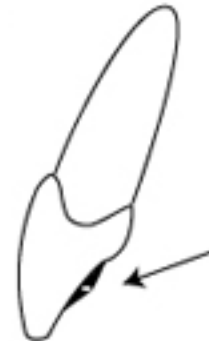
The OrthoCure brace

Ultra smooth, customized dome shaped outer surface with extremely low profile